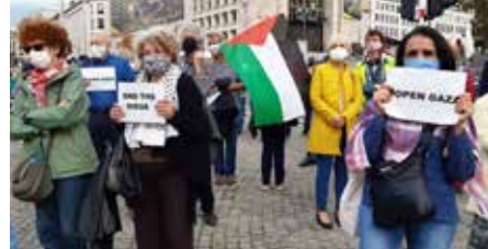
August 31, 2020: 150 people demonstrated, in line with the health measures, against the Israeli bombings in Gaza.

Under the slogan ‘Support the worldwide struggle against the coronavirus’, we highlighted the fight against the coronavirus in our partners countries: Congo, the Philippines, Palestine and Cuba. Together with numerous organisations and social movements, we asked the government to help make the COVID-19 vaccine a global common good. Because everyone deserves protection. We also stressed the importance of a strong public health system that doesn’t discriminate between rich and poor. Public health services are the best guarantee of an effective response to a health crisis such as the one caused by the coronavirus.