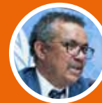
DR. TEDROS ADHANOM GHEBREYESUS

Director-General of the World Health Organization (in answer to a question from Viva Salud on human rights during the coronavirus pandemic)